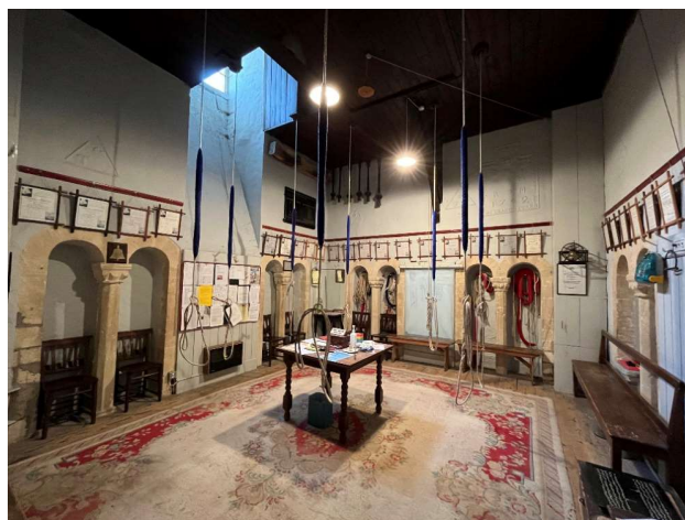
The ringing chamber at Bampton. One of the towers opened for the 2023 AGM.

The guild has been busy throughout 2023. Training days, workshops, a glorious AGM, and of course the fantastic Guild Festival. In the background, driving the cogs, we had committee meetings, officers and workgroups all working hard for the ODG ringer.