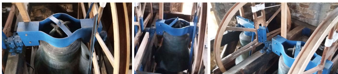
Photographs of the bells and church tower taken from the Chalgrove Church website (chalgrovechurch.org)